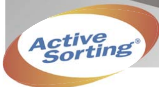
ICP Active -9 Standard