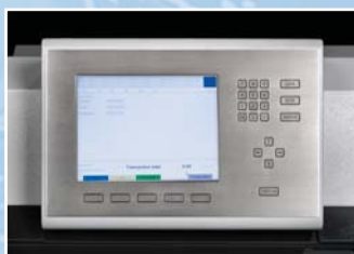
10.4" colour screen with customisable interface for ICP Active-9 Flex version.