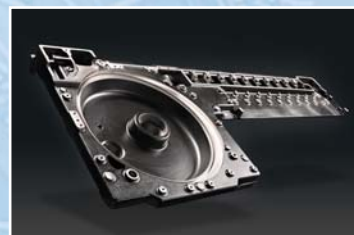
Solid platform in cast iron for maximum reliability.