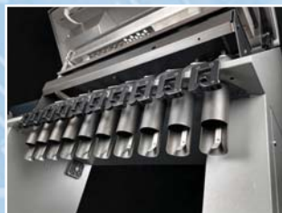
Nine active outlets and one passive reject outlet.