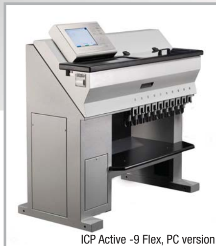
ICP Active -9 Flex, PC version